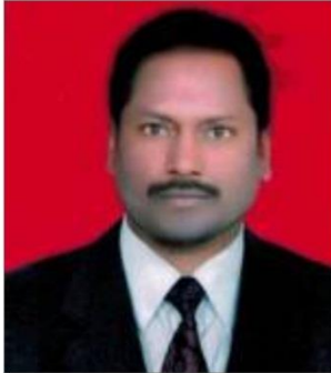
HVAC & MHE Maintenance