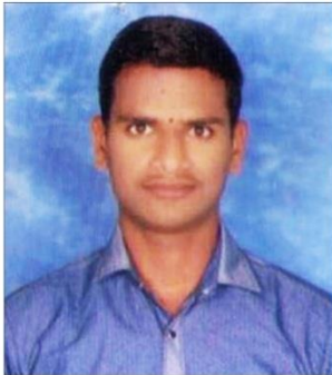
Rodient & Insect Pest Controller